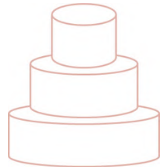
5"/8"/11" (6-7kg) Serves 100-150pax

The above measurements and servings are only estimates. It will ultimately depend on the portion sizes you serve to your guests. If you are unsure, chat with us!