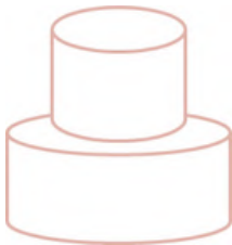
5"/8" (2.5kg) Serves 20-40pax