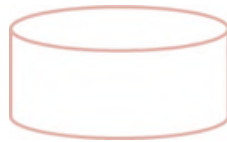
8" (1.5kg) Serves 10-20pax