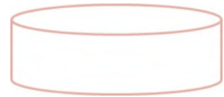
11" (3kg) Serves 40-50pax